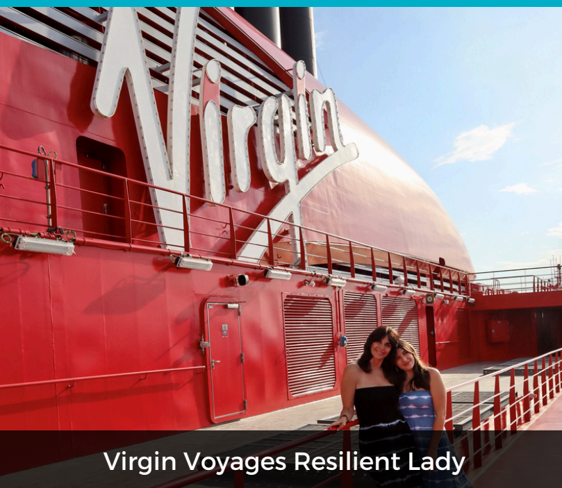
Virgin Voyages Resilient Lady